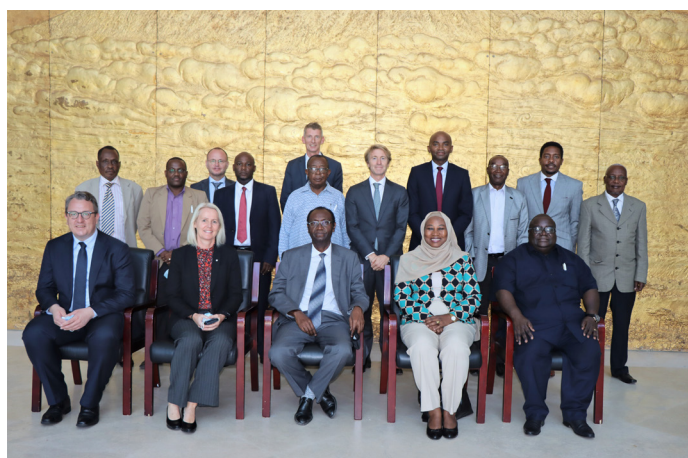
Members of PURA's Board of Directors with top officials of Shell and Equinor companies in a group photo after a meeting about the implementation of the LNG project. The meeting took place in October, 2021 in Dar es Salaam.