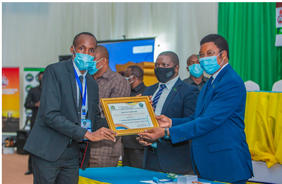
A representative from PURA (Ebeneza Mollel) receiving a recognition certificate from the Prime Minister (Hon. Kassim Majaliwa Majaliwa) following PURA's sponsorship to the Empowerment Forum 2021.

Among dignitaries and high profile participants from the Government side who turned up for the event were Ministers (Minister of State, Prime Minister's Office responsible for Investments