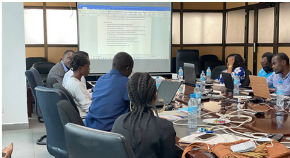
Workshop participants from EWURA and PURA brainstorming after the consultant had demonstrated the Common Qualification System (CQS)

The above-hinted workshop was attended by over thirteen participants including the Director of Natural Gas from EWURA and Head of Local Content and Stakeholders Engagement from PURA. While demonstrating the database during the workshop, the consultant explained that the system is designed to allow registration of three group categories namely, local suppliers and service providers; professionals; and companies