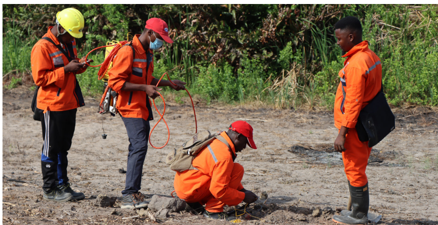
Tanzania youths blasting dynamites during the 3D seismic data acquisition project in Ruvu block. These are among other Tanzanians who were employed at the project since January, 2021.

to the procurement of goods and services needed during implementation of such projects, trainings for locals, technology transfer and implementation of corporate social responsibility (CSR) to the communities surrounding the projects," he added.