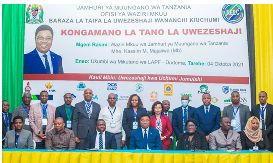
The Guest of Honor (Hon. Kassim Majaliwa Majaliwa) in a group photo with all sponsors of the Empowerment Forum 2021.

PURA has a legal obligation to promote local participation in the upstream petroleum activities. Upon fulfilling such obligation, the Authority works closely with various stakeholders including NEEC and supports various local content-related initiatives aimed at capacitating Tanzanians to actively participate in upstream petroleum activities.