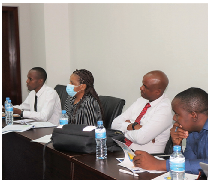
A section of PURA staff following keenly the presentation which were being delivered during the session.