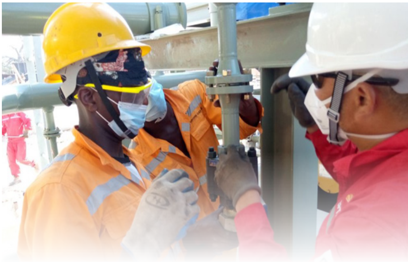
The Chinese expatriate working with a Tanzanian employee during implementation of compression project at Songo Songo block.

Natural gas production from Songo Songo Block began in 2004 where as of June, 2021 a total of 469.13 billion cubic feet had been generated for electricity, industrial, domestic and automotive use.