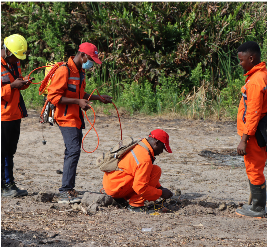
Tanzania youths blasting dynamites during the 3D seismic data acquisition project in Ruvu block. These are among other Tanzanians who were employed at the project since January, 2021.

The project, which was to be completed in March 2022, was finalized in October, 2021. The remaining activities include settling disclosure of compensation payments and resolving grievances of the people affected by the project and rehabilitating land areas damaged during the exploration.